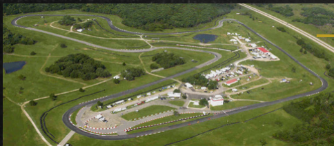
Hallett Motor Racing Circuit, OK

*All Endurance classes pay out up to 7th place. This will solely depend on sponsorship and entries.