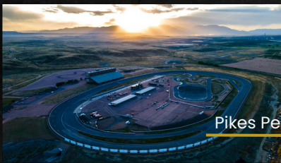
Pikes Peak International Raceway, CO