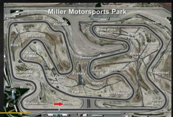
Utah Motorsports Campus, UT