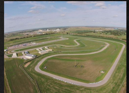
Motorsports Park Hastings, NE