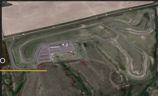
High Plains Raceway, CO